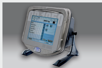
DD1050 DIADE series weighing indicator

The bin is weighed on a weighing platform selected from the extensive CB range