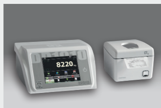
DD1010 Weighing indicator with STB Q3 printer