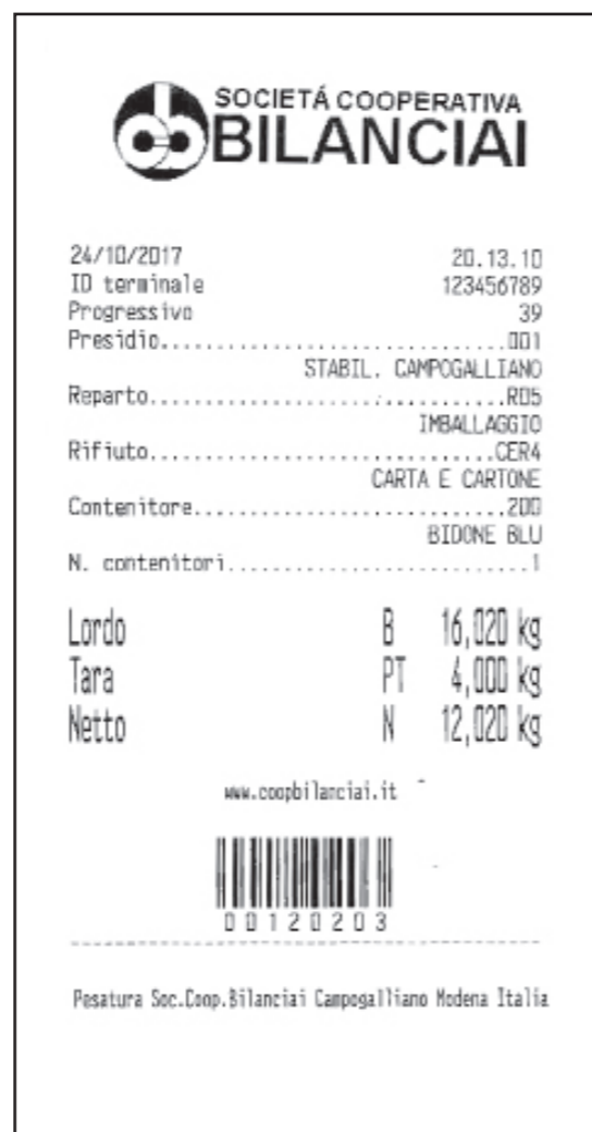
Example of printed ticket