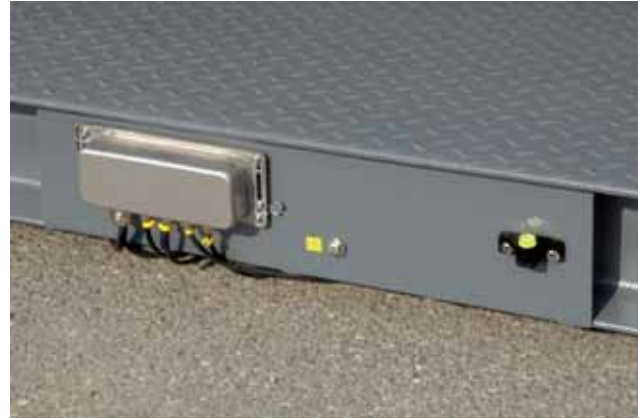
Stainless steel junction box