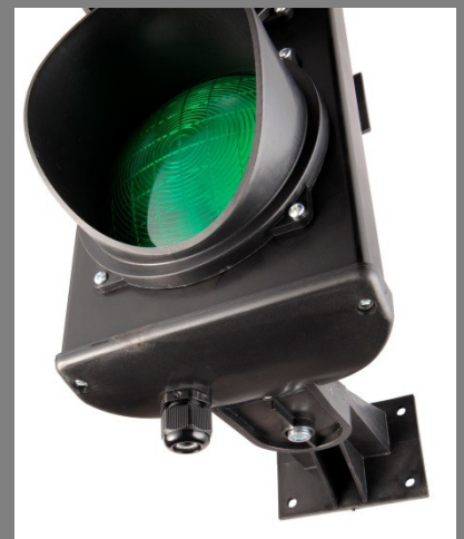
M20 cable entry