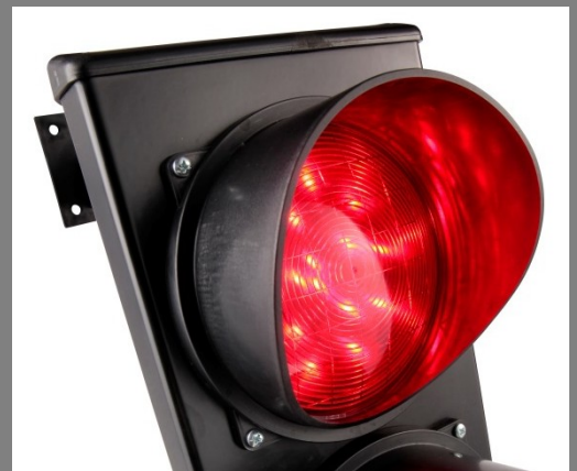
Illuminated red light